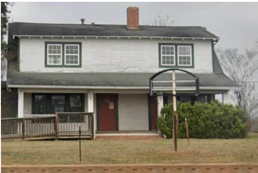
The Sanders home on Highway 87 in a photo taken around 2020. The year of the second floor addition is unknown.